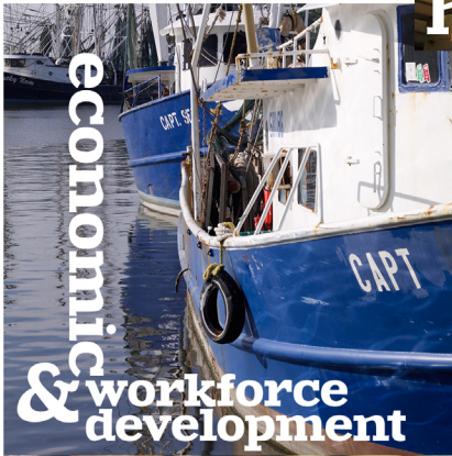
economic & workforce development