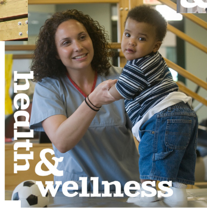
health & wellness