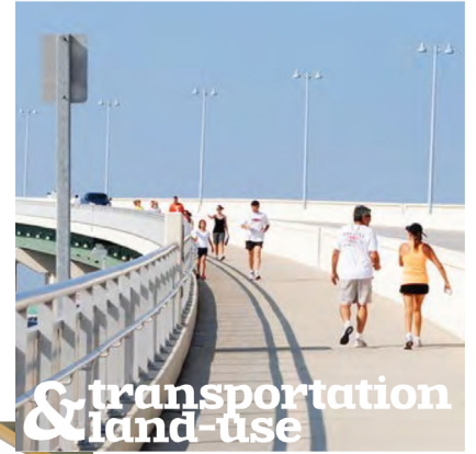
transportation & land-use